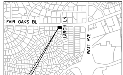
KEY MAP SERVICE LOCATION

FOR USE DURING CONSTRUCTION PRESSURE @ HOSE BIB: _____ STATIC PRESSURE (p.s.i.): _____ RESIDUAL PRESSURE (p.s.i.): _____ DATED CHECKED: _____