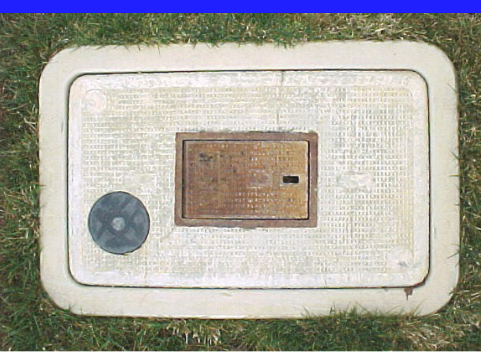
"Managing Tomorrow's Water Today"