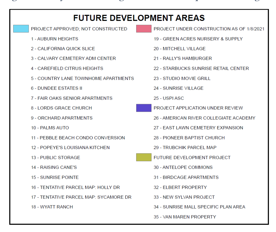
Table A-15 City of Citrus Heights – Future Development Parcels and Acres by Development Stage Summary